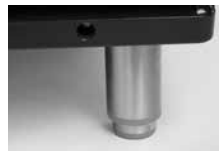
Adjustable legs (from 101-152mm) available with optional leg kit K-00345.