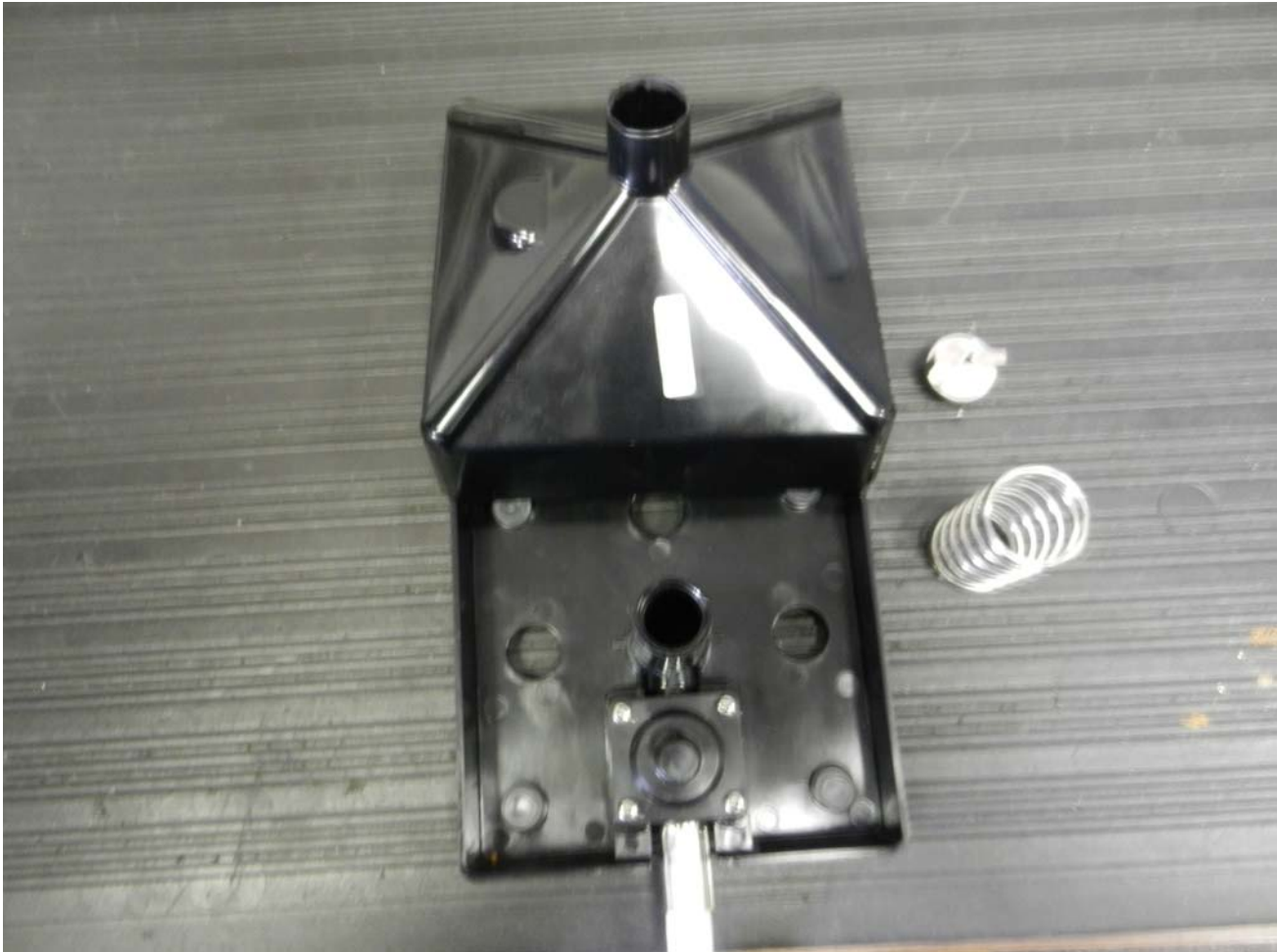
Figure1. Interior View of Unit with Spring and Nozzle Removed

PROPRIETARY RIGHTS NOTICE This document and all information contained within it is the property of Hamilton Beach Brands, Inc. (HBB). It is confidential and proprietary and has been provided to you for a limited purpose. It must be returned or destroyed upon request. Disclosure, reproduction or use of this document and any information contained within it, in full or in part, for any purpose is forbidden without the prior written consent of HBB. No photographs may be taken of any article fabricated or assembled from this document without the prior written consent of HBB.